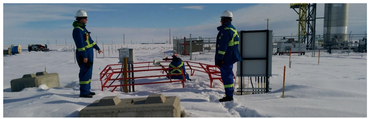
Above: workers debate the precise source of emissions from an upstream wellhead.

The technical challenge here is vents and leaks are physically interspersed on upstream pads. Vents from pneumatic controllers are typically led to the exterior of separator buildings, and leaks from the equipment inside the buildings may be seeping from building vents. Casing vents from wellheads are directly adjacent to any leaks on the 'Christmas tree' or adjacent piping. Any vents on tanks is similarly adjacent to any leaks in the supply piping.